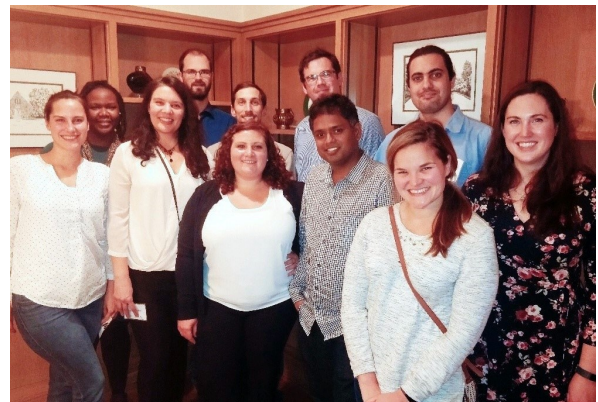
MSU-PDA Steering Committee—Nov. 2018

The MSU PDA is an association of postdoctoral fellows from all disciplines across the Michigan State University campus.