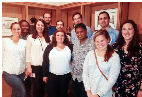
MSU-PDA Steering Committee—Nov. 2018

The MSU PDA is an association of postdoctoral fellows from all disciplines across the Michigan State University campus.