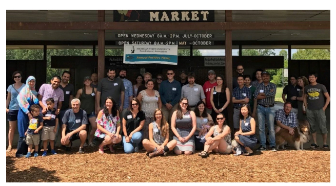
Postdocs at the Annual Picnic (July 2017)

The MSU PDA is an association of postdoctoral fellows from all disciplines across the Michigan State University campus.